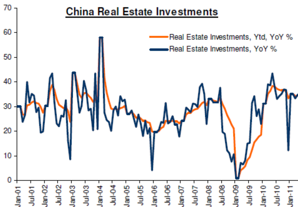
Chart 3: Property investment accelerating not slowing